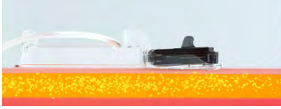
Place Dermapose Access

ELEVATE SKIN UNDER VACUUM DIRECTLY INTO THE 90 ML ACCESS CAVITY. ARTICULATE INFILTRATION AND HARVESTING CANNULA WITH MM PRECISION.