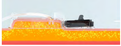
Elevate skin using vacuum