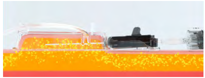
Insert Refresh through Needle Access point